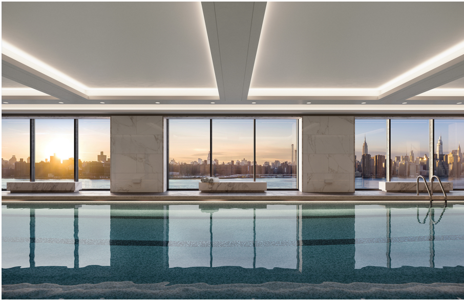
Indoor pool at 60 Wharf Drive, part of West Wharf in Greenpoint, Brooklyn