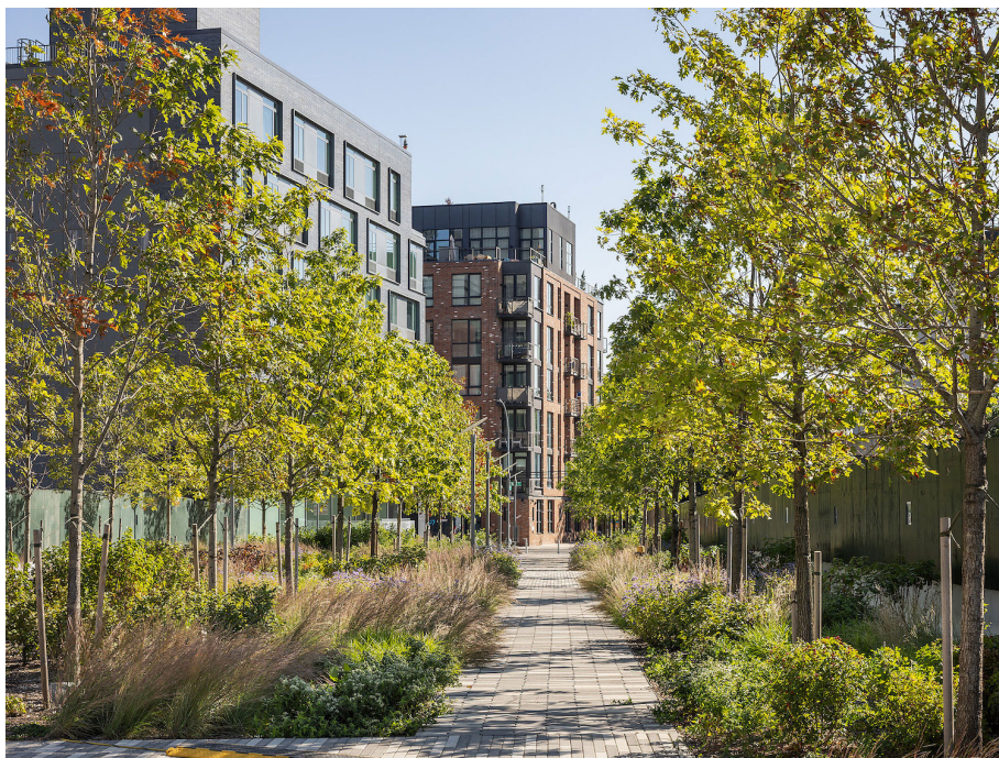
Wharf Plaza view looking towards West Street in Greenpoint, Brooklyn