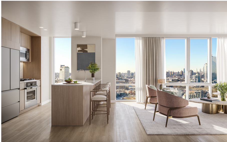
Residential kitchen at 60 Wharf Drive, part of West Wharf in Greenpoint, Brooklyn