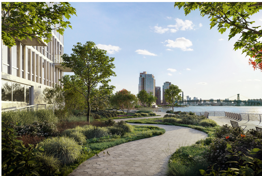
Eastside overlook at 60 Wharf Drive, part of West Wharf in Greenpoint, Brooklyn

The majority of residences come with balconies and nearly all with views of the East River, Manhattan skyline, and Brooklyn cityscapes. Monthly rents begin at $3,300 for studios, $4,080 for one-bedrooms, $6,325 for two-bedrooms, and $8,800 for three-bedroom layouts.