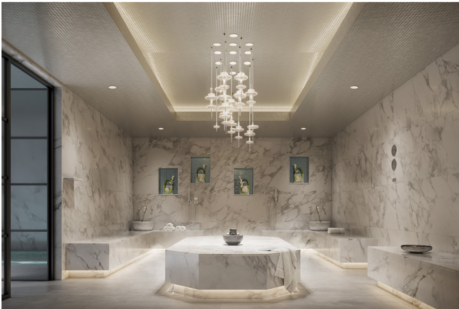
Hamam at 60 Wharf Drive, part of West Wharf in Greenpoint, Brooklyn