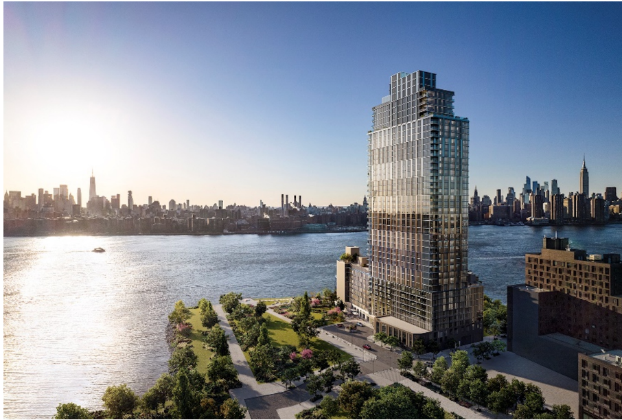
60 Wharf Drive at West Wharf via Halcyon

BY: VANESSA LONDONO 8:00 AM ON OCTOBER 16, 2023 This post links to a YIMBY partner / Advertise on YIMBY