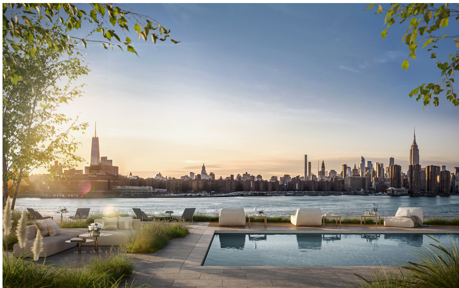
Rooftop terrace at 60 Wharf Drive, part of West Wharf in Greenpoint, Brooklyn