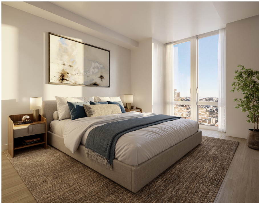
Residential bedroom at 60 Wharf Drive, part of West Wharf in Greenpoint, Brooklyn

Residents will have access to a wide range of amenities including a landscaped rooftop terrace with panoramic views of the Manhattan skyline; a state-of-the-art fitness center; a spa with steam rooms, saunas, experience shower, hot tub, cold plunge tub, whirlpool, marble-lined hammam, and a salt inhalation and meditation room; a lounge with a fireplace; a billiards room; a dedicated concierge service to assist residents with their daily needs and handle package deliveries. Other amenities include co-working hub; bike storage; indoor and outdoor pools; indoor basketball courts; bowling alley; two PGA golf simulators; music room and podcast/recording studio; a children's walk-in wading pool, indoor playroom, and teen game room; pet grooming station; package room with refrigerated storage, resident storage, parking garage with electric vehicle charging stations, and two screening rooms with media lounge.