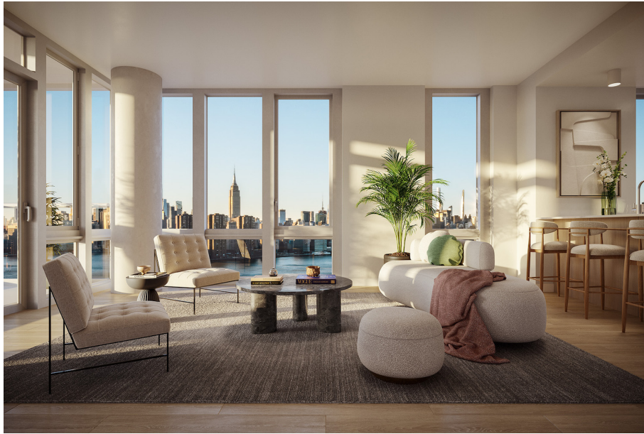
Residential living room at 60 Wharf Drive, part of West Wharf in Greenpoint, Brooklyn

Residences are outfitted with operable floor-to-ceiling Thermopane windows, high ceilings, white oak hardwood floors, central HVAC climate control, walk-in closets, and fiber optics. Kitchens have stainless steel appliances with gas cooktops and ranges, light wood cabinetry, full-height backsplashes, and white Quartz countertops.