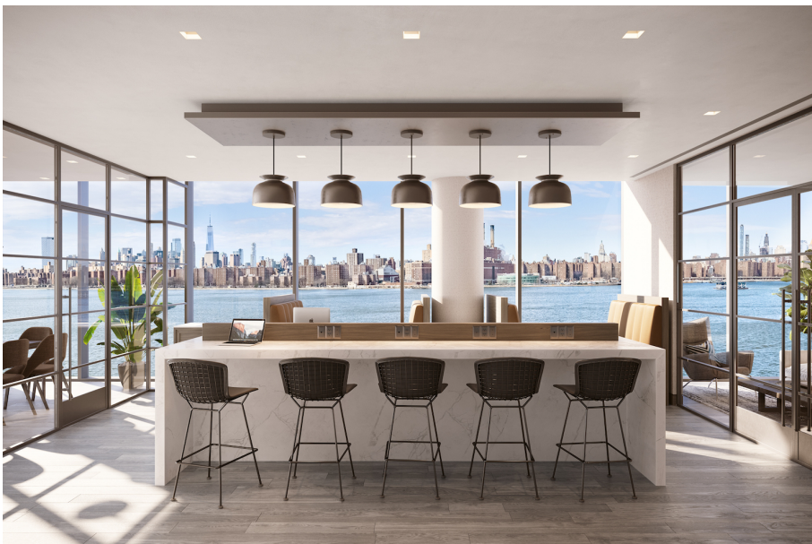
Business center at 60 Wharf Drive, part of West Wharf in Greenpoint, Brooklyn